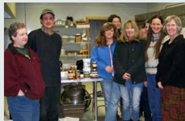
“From Specialty Foods to Value Added Food Products” class, Barre

And a Marketing Series on pricing, profit, and budgeting